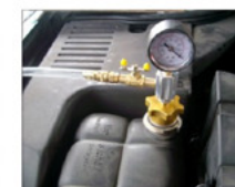
Fill new radiator liquid