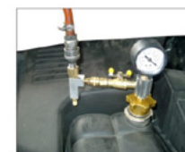
Vacuum by air